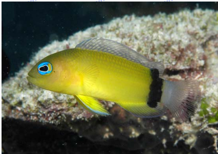
Fig. 3. Underwater photograph of a Manonichthys jamali sp. nov. juvenile, approximately 40 mm TL, from 12 m in depth, Pulau Tumbu Tumbu, Irian Jaya Barat Province, Indonesia.

Lower lip incomplete; dorsal and anal fins without scale sheaths, although sometimes with intermittent scales overlapping fin bases; predorsal scales extending anteriorly to level of middle of interorbital (point ranging slightly posterior or slightly anterior to posterior AIO pores using terminology of Gill 2003); opercle without externally visible serrations; teeth of gill rakers of outer ceratobranchial 1 well developed on tips only; dorsal and anal-fin spines moderately stout and pungent, 2nd anal spine much stouter than 3rd; pelvic-fin spine moderately stout and pungent; 2nd or 3rd segmented pelvic-fin ray longest; caudal fin truncate to weakly emarginate in