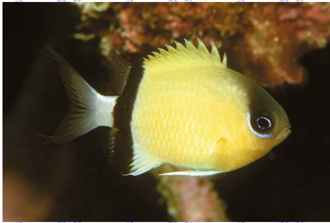
Fig. 5. Underwater photograph of Chromis retrofasciata , approximately 40 mm TL, at 12 m in depth, Great Barrier Reef, Australia.

retrofasciatus , which is generally far more abundant. This appears to be a form of aggressive mimicry (Wickler 1965 1968), in which the resemblance to the damselfish enables the pseudochromid to get closer to its prey (i.e., small fishes). Munday et al. (2003) reported a similar relationship involving Pseudochromis fuscus and 3 species of damselfishes in the genus Pomacentrus . Laboratory experiments revealed that the dottyback preferentially selects habitat patches occupied by similarly colored damselfishes. Pseudochromis fuscus is a predator of small fishes, including newly recruited damselfishes. Finally, Randall (2005) provided an extensive review of mimicry in marine fishes including examples of aggressive mimicry in which the juveniles of various serranids and lutjanids mimicked at least 9 different species of pomacentrids.