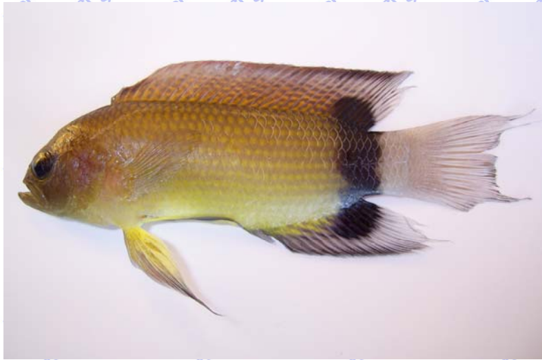
Fig. 1. Manonichthys jamali sp. nov. freshly collected holotype, 58.4 mm SL, Pulau Tumbu Tumbu, Irian Jaya Barat Province, Indonesia.

Description (based on 9 specimens, 36.7-58.4 mm SL): minimum and maximum value ranges given first for all type specimens, followed, where different, by values for holotype (enclosed in parentheses): dorsal-fin rays III,28 or 29 except IV,24 in 1 paratype (III,29), last 5-11 (11) segmented rays branched; anal-fin rays III,15 (III,16), all or last 8-14 (all) segmented rays branched; pectoral-fin rays 16 or 17, usually 17 (17); upper procurrent caudal-fin rays 6; lower procurrent caudal rays 5 or 6 (6); total caudal-fin rays 27 or 28 (29); scales in lateral series 42-45 (42); anterior lateral-line scales 23-29 (27); anterior lateral line terminating beneath segmented dorsal-fin ray 15-20 (19); posterior lateral-line scales 7-11 + 0-2 (8 + 2); scales between lateral lines 1-5 (3); horizontal scale rows above anal fin origin 12 + 1 + 2 = 15 (11 + 1 + 2 = 14); circumpeduncular scales 16 or 17 (16); predorsal scales 20-24 (21); scales behind eye 3; scales to preopercular angle 5 or 6 (5); gill rakers 4 or 5 + 12 = 16-18, usually 17 (5 + 12); pseudobranch filaments 9 or 10 (11); circumorbital pores 15-20 (20); preopercular pores 9 or 10 (11); dentary pores 4; anterior interorbital pores 3; posterior interorbital pores 1.