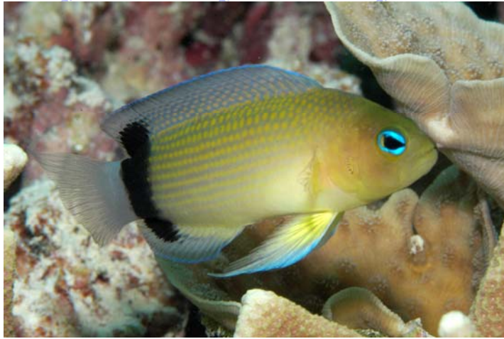
Fig. 2. Underwater photograph of Manonichthys jamali sp. nov. adult, approximately 75 mm TL, from 12 m in depth, Pulau Tumbu Tumbu, Irian Jaya Barat Province, Indonesia.